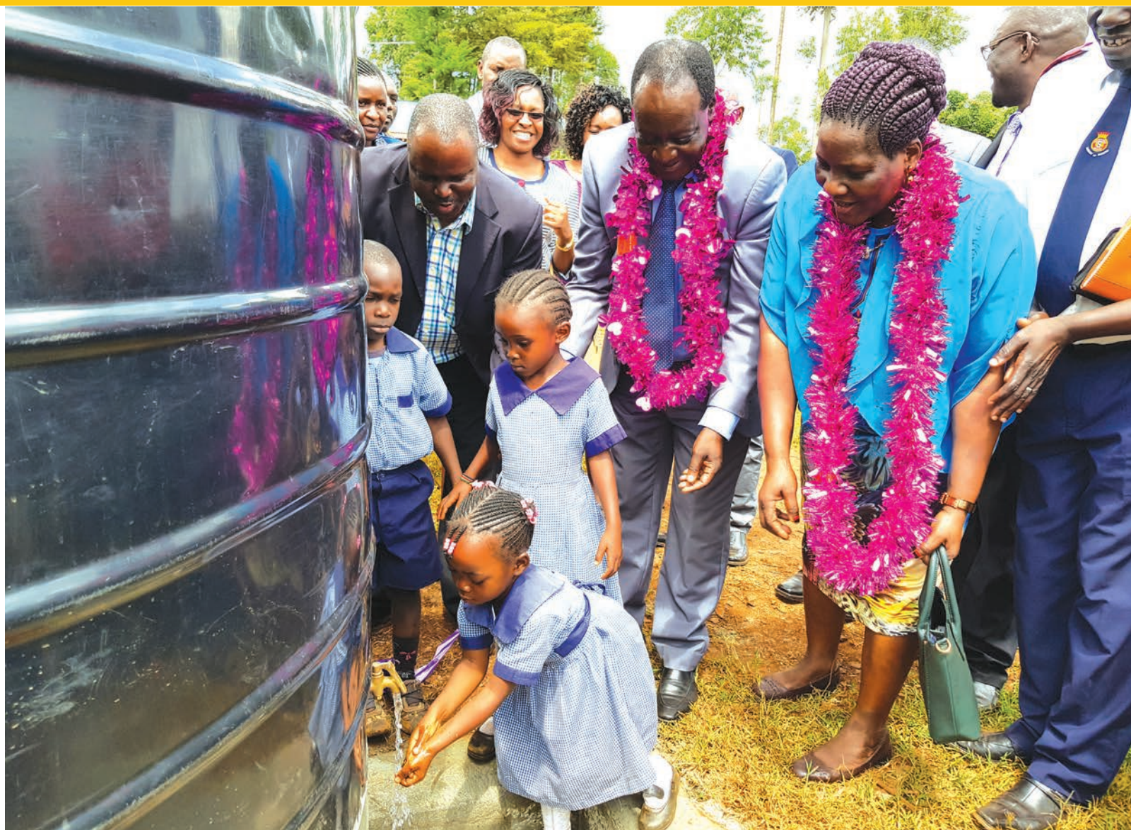
The Governor Issuing water tanks to ECDE schools across the County. A total of 50 water tanks were issued