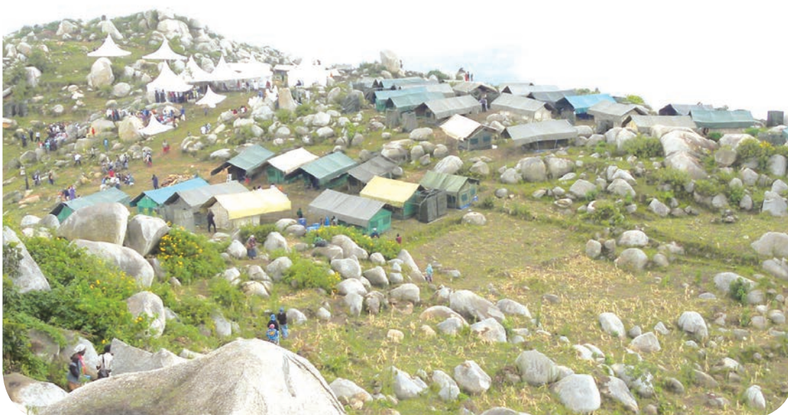
Tourists Camping on Maragoli hills