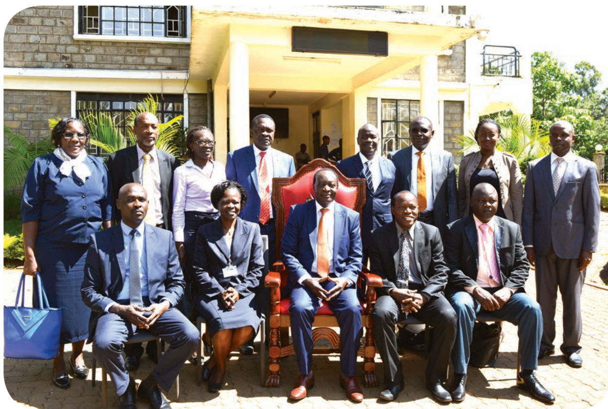
The Governor and Deputy Governor of Vihiga County with County Executive Committee Members (Standing)