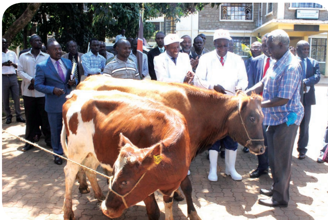
H.E the Governor and his Deputy issuing dairy cattle to farmers under the department of agriculture dairy farming programme