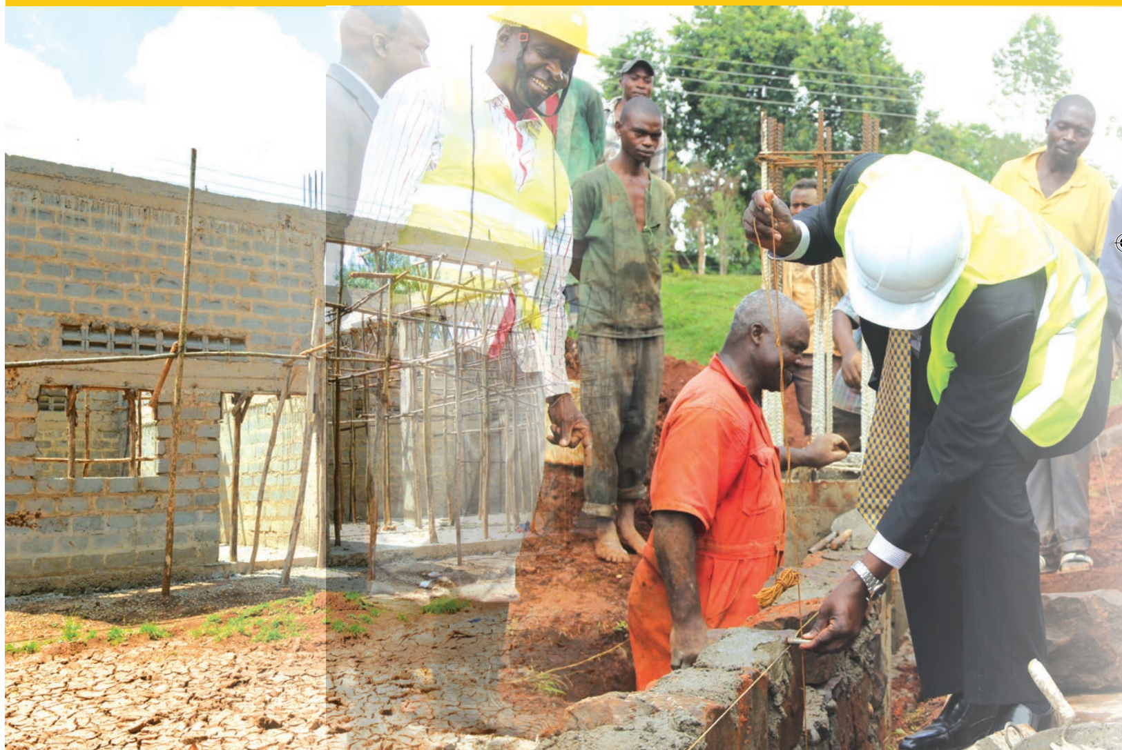
The Governor launching the Construction of Vihiga County Mechanical Unit