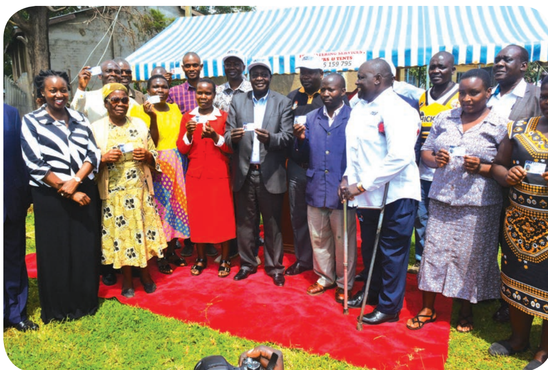
H.E Governor Wilber Ottichilo issuing health insurance cards to community health volunteers (CHVs) and vulnerable households under the department of Social services social protection programme