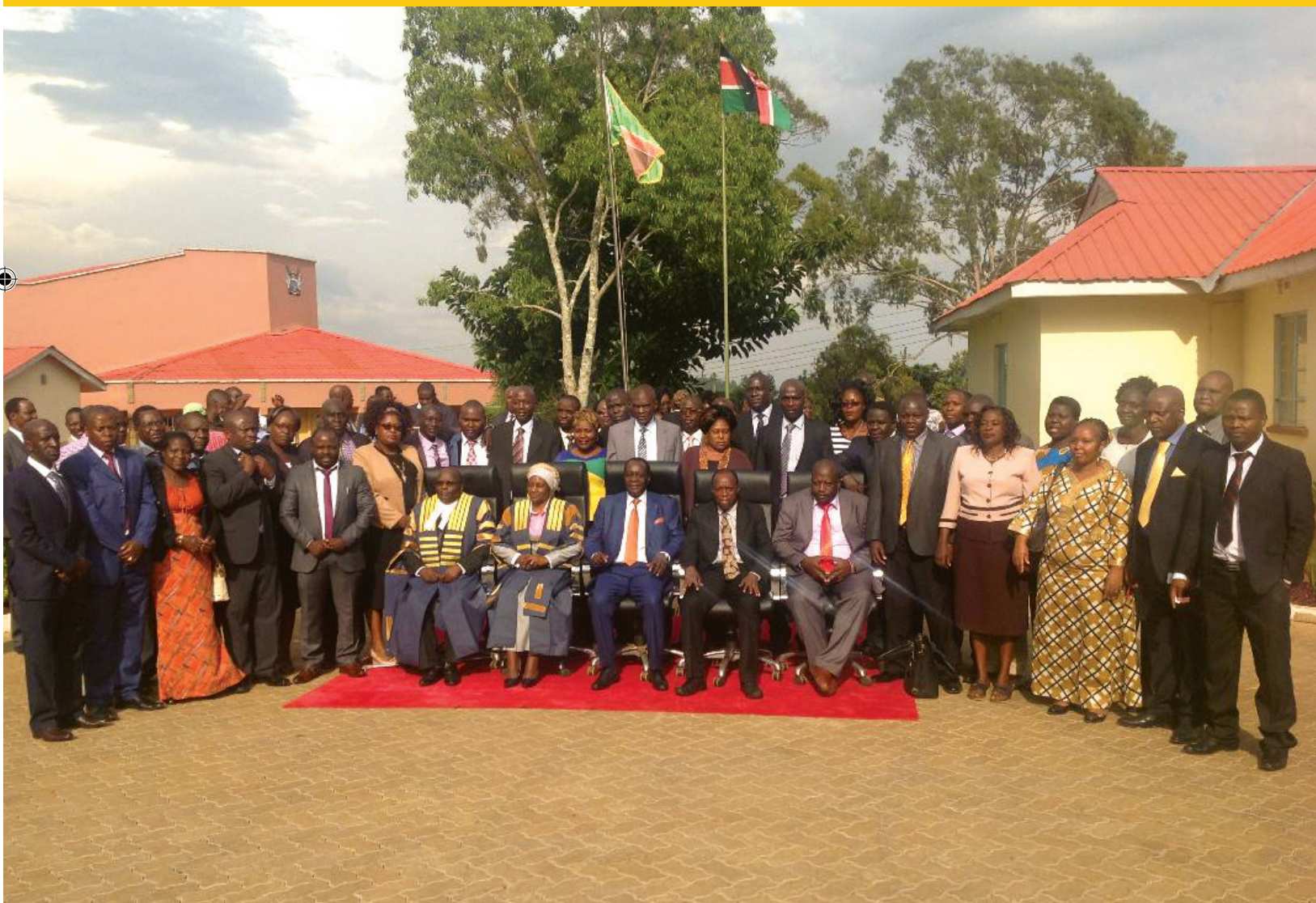
The Governor, Deputy Governor, Speaker of the County Assembly of Vihiga and the Clerk of the County Assembly with all the MCAs of Vihiga County.