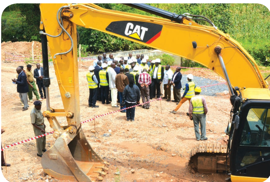
Governor Wilber Ottichilo together with the national CS for water Simon Chelugui inspecting the progress of the KES 1.8 billion, Belgium water project