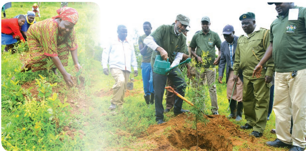
County executive staff members joining up with residents of Vihiga county to plant trees during the World Environment Day