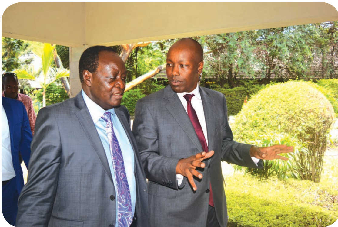
H.E Governor Wilber Ottichilo with the Governor of Nakuru county H.E Lee Kinyanjui during the National Water summit in Naivasha