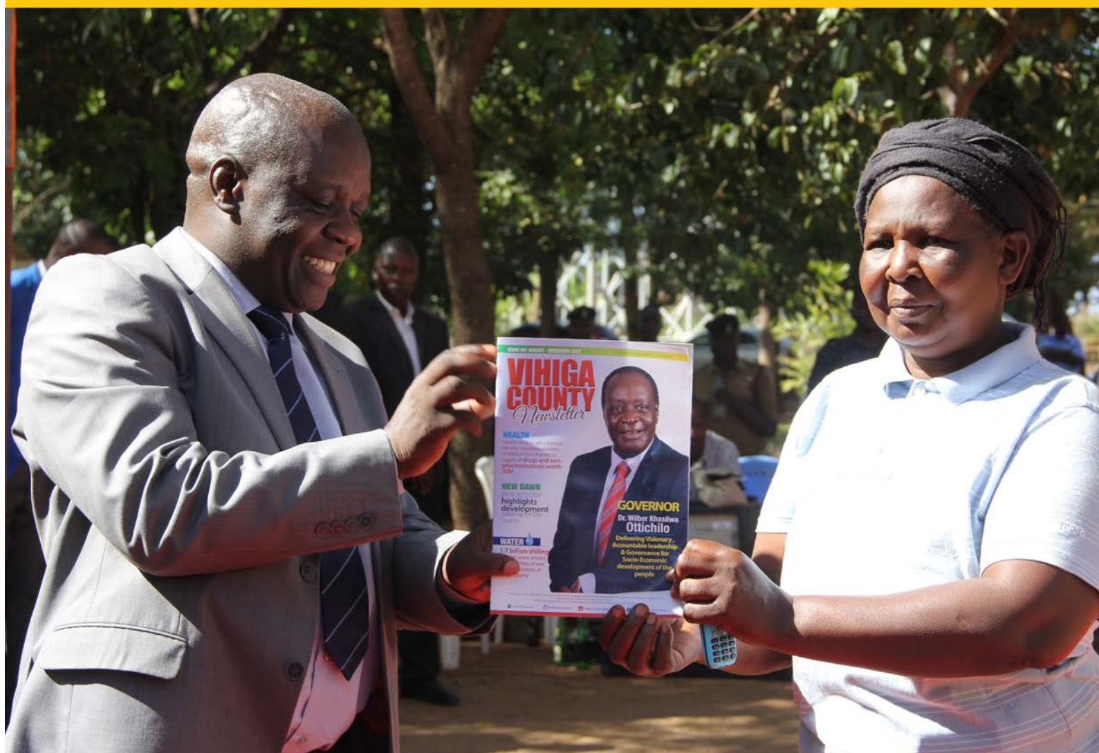
Vihiga County Quarterly Newsletter