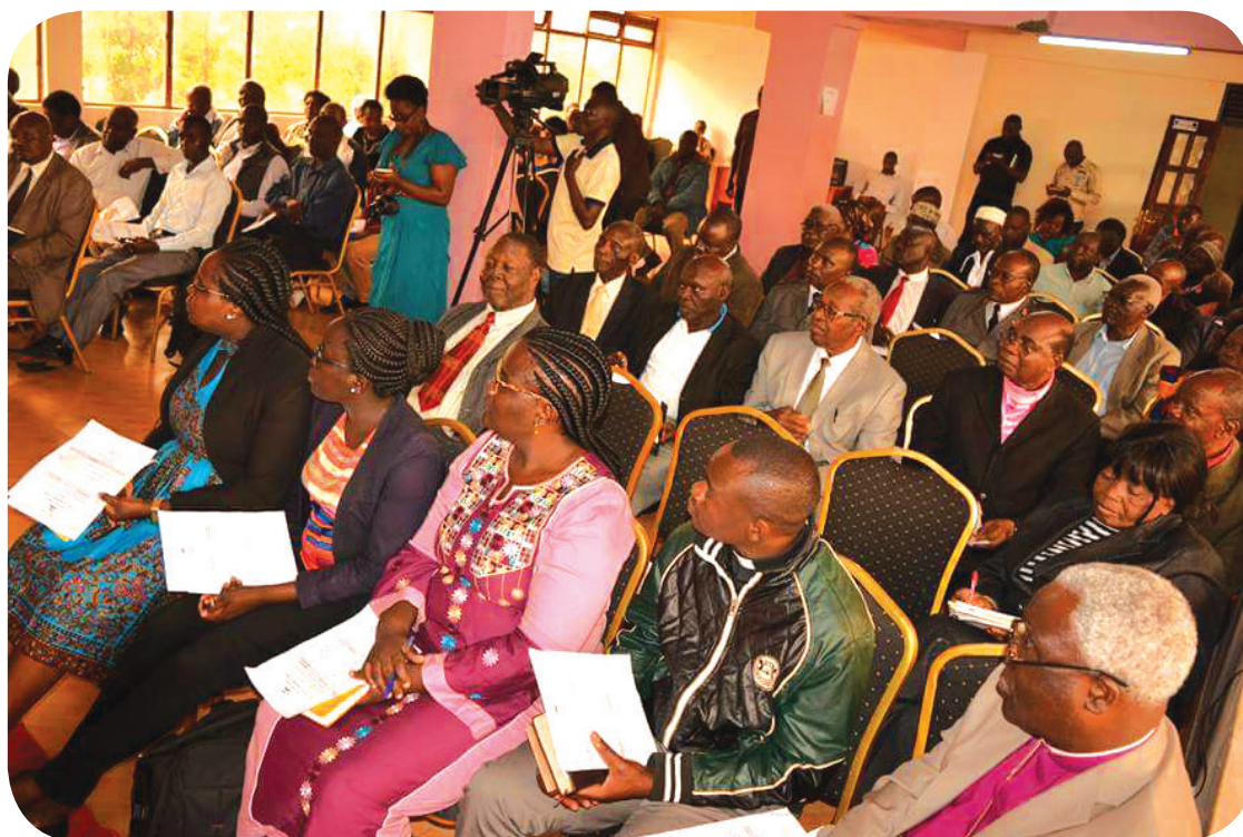
Vihiga County Cohesion and Integration Council meeting