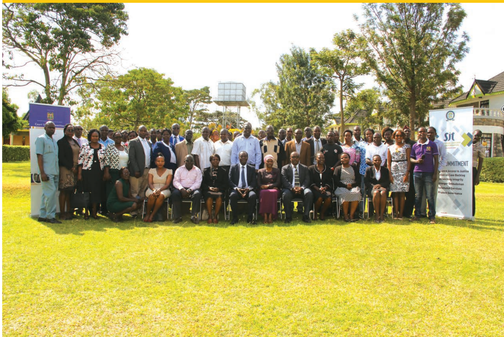
Vihiga County Court Users Committee