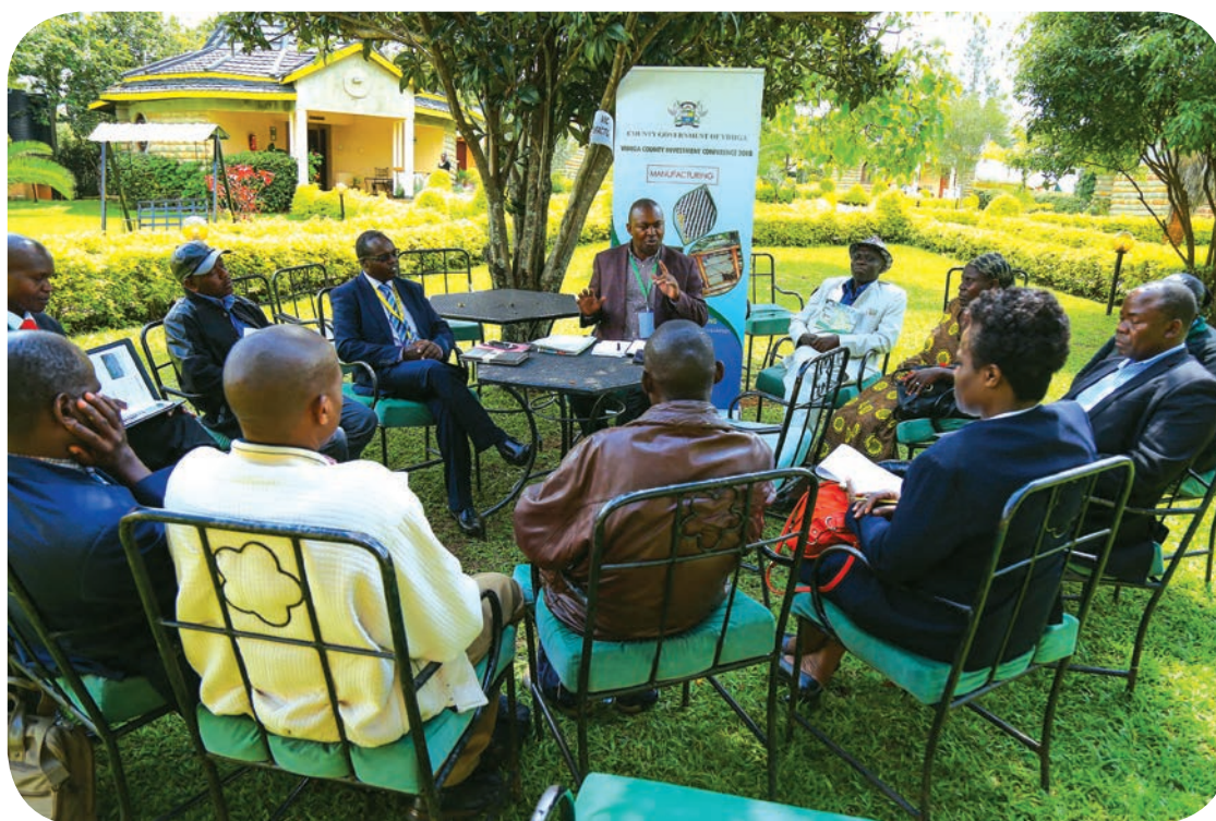
Delegates Sector discussion groups on trade development and investment in Vihiga county during the Vihiga County investment conference 2018