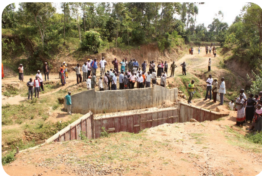
H.E. Governor Wilber Ottichilo and the Transport and Infrastructure team inspecting a stalled bridge in South Maragoli ward