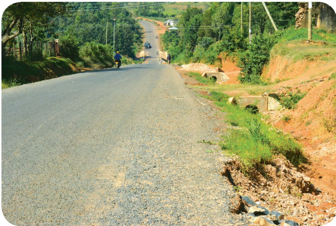
Luanda-Ekwanda Road upgraded to low volume seal Standard