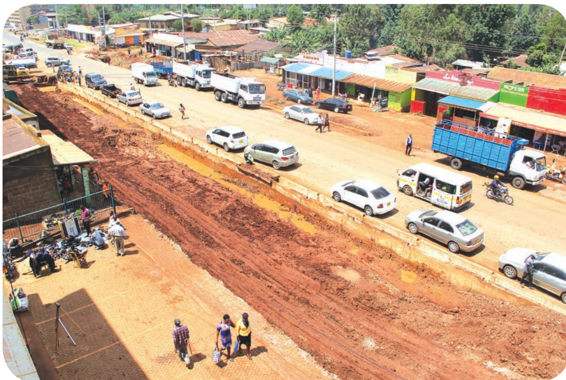
Mbale town urban facelift done by China Overseas Engineering Company (COVEC)