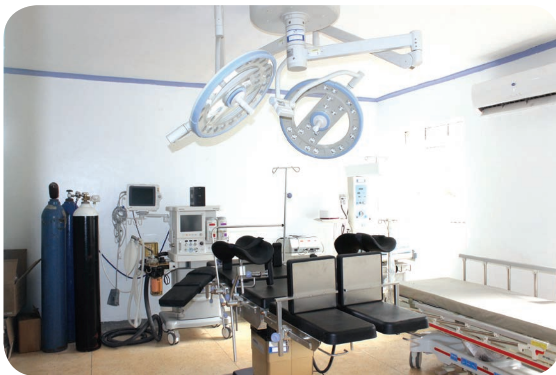
Theatre room in the newborn unit at Emuhaya sub-county hospital