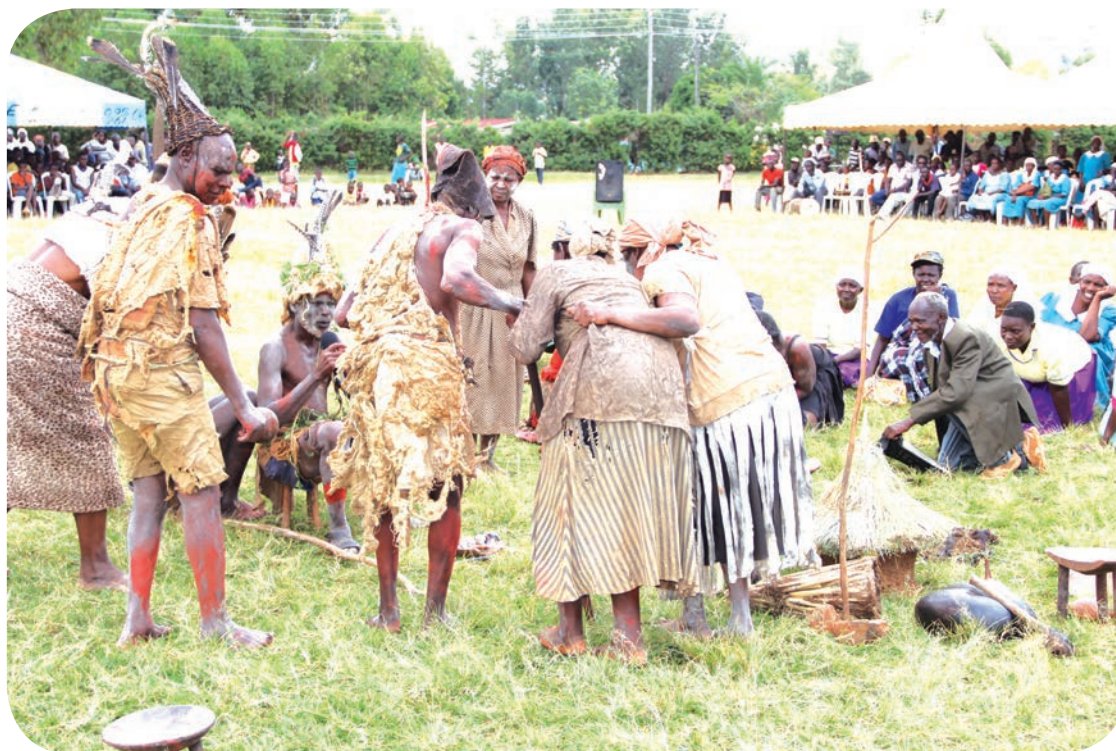
The annual Bunyore Cultural festival