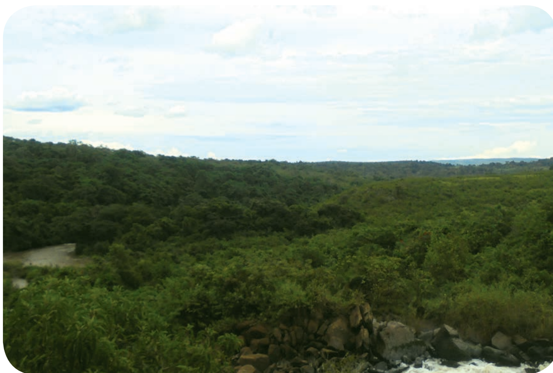
Kibiri Forest in Vihiga County is an extension of Kakamega Forest: Vihiga County eco-tourism jewel for nature walks and ecological excursions