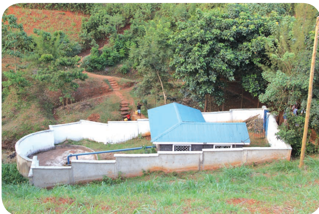
Mbihi Water Project almost ready to start supplying water to Mbihi and Mbale areas