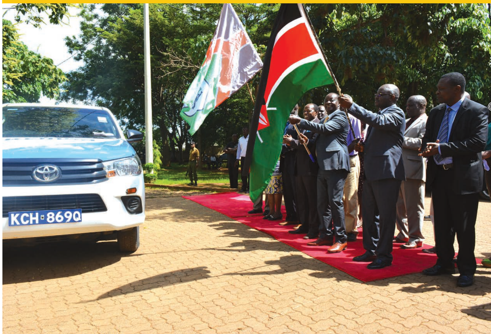
The Governor and his deputy flagging off the second consignment of KEMSA drugs to all Health facilities