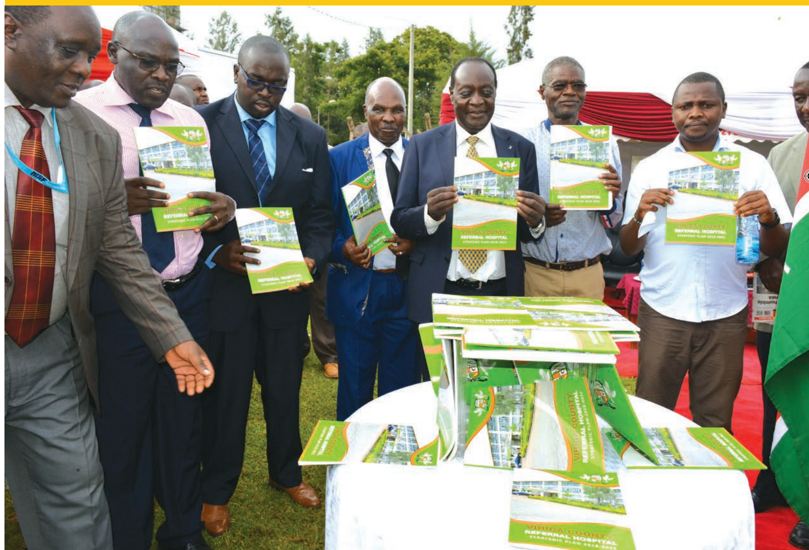
Launch of Vihiga County Referral Hospital Strategic Plan