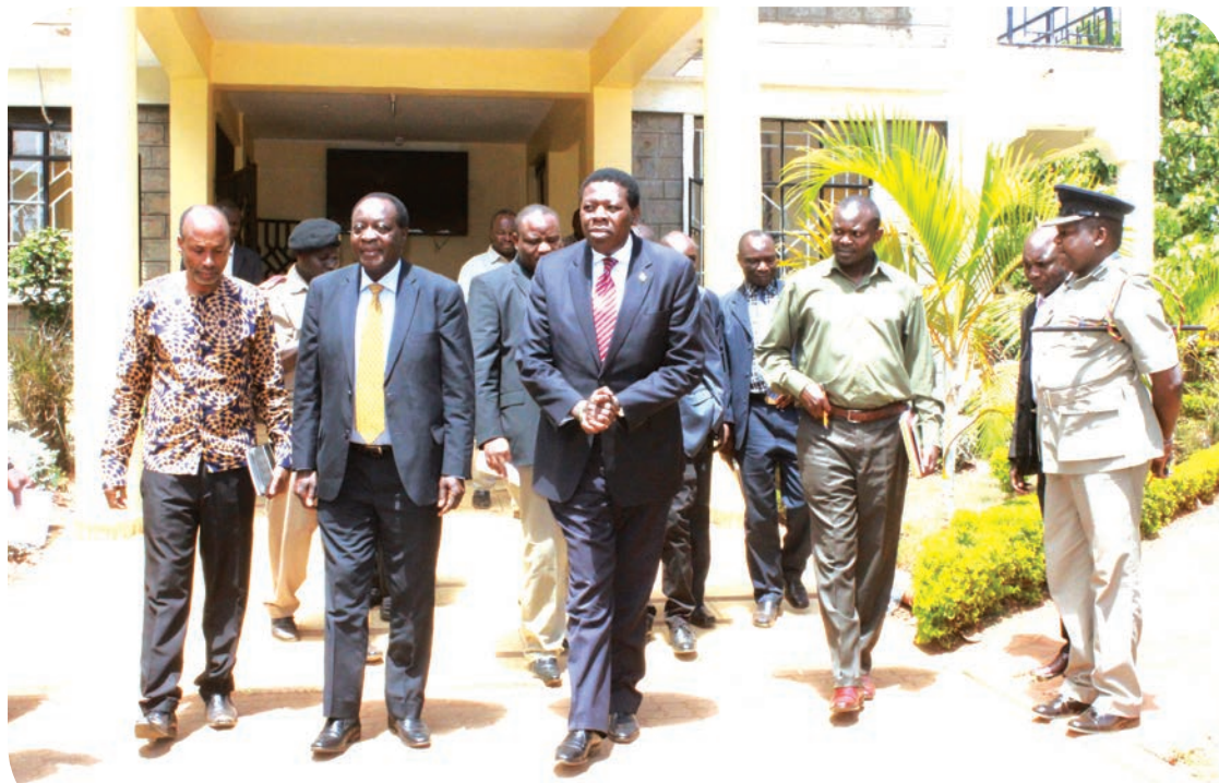
H.E Governor Wilber Ottichilo with Hon. Eugene Wamalwa during his first official visit as the CS for Devolution and ASALs