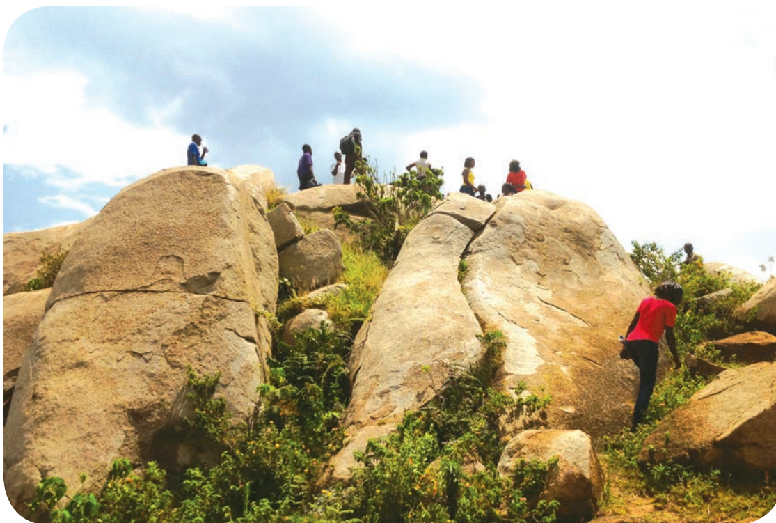
Hikers Enjoying the View on top of Maragoli Hills: unique tourism destination of Vihiga County