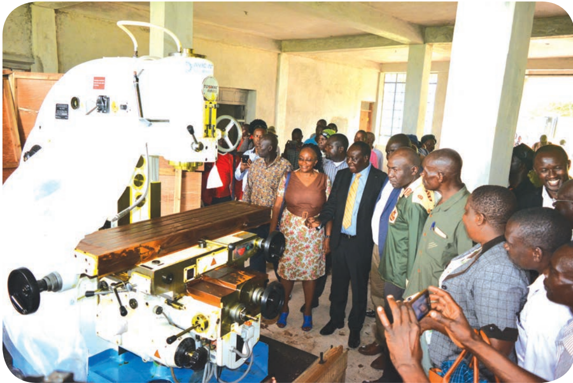
Governor Wilber Ottichilo accompanied by Hon. Omboko Milemba MP Emuhaya receiving state of the art mechanical equipment from South Korea worth KES 50 million for Ebukanga technical training institute