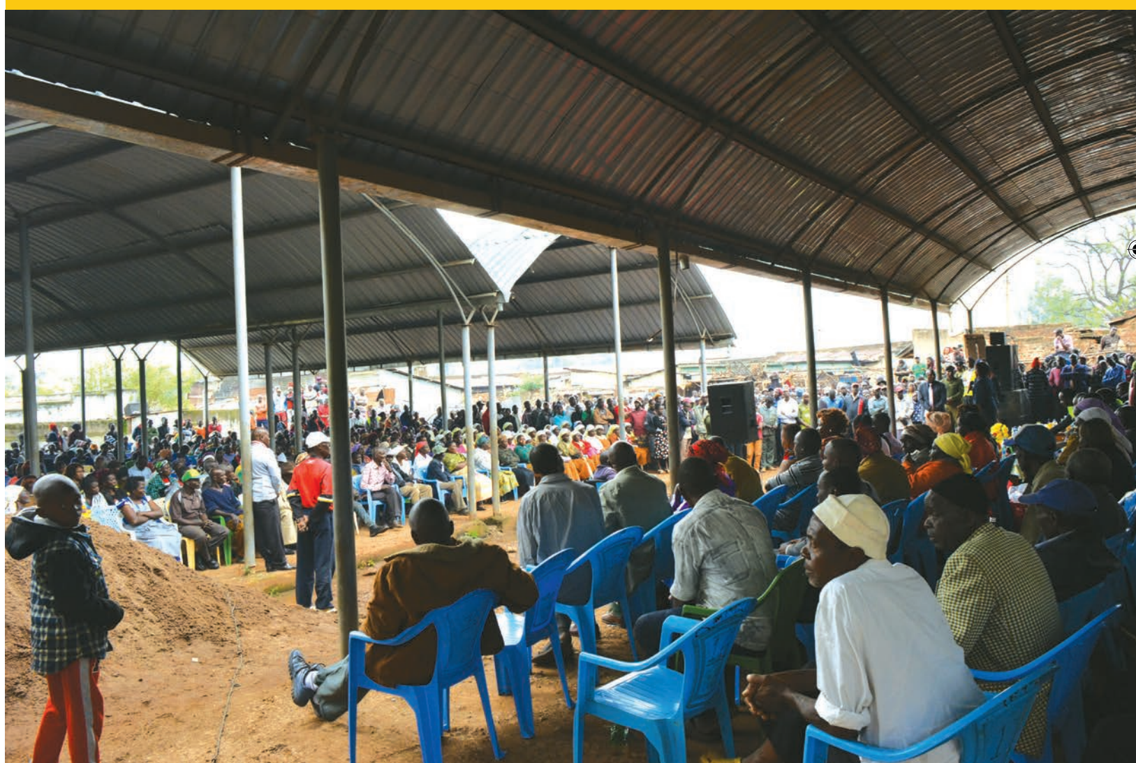
Luanda Market Traders meeting with the Governor during the commencement of construction of Luanda Omena Market