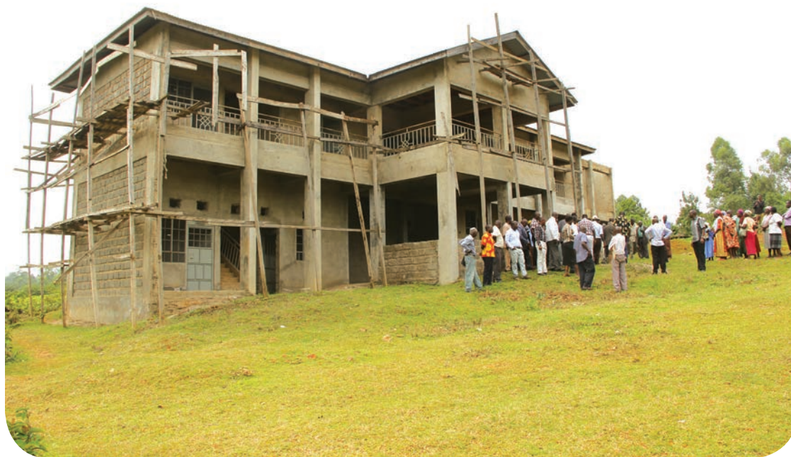
H.E. Governor Wilber Ottichilo touring Evojo Health Centre; a stalled projects earmarked for completion

Further, the Governor will establish in his office a Delivery Unit which will independently conduct monitoring and evaluation of project implementation and directly report to his office.