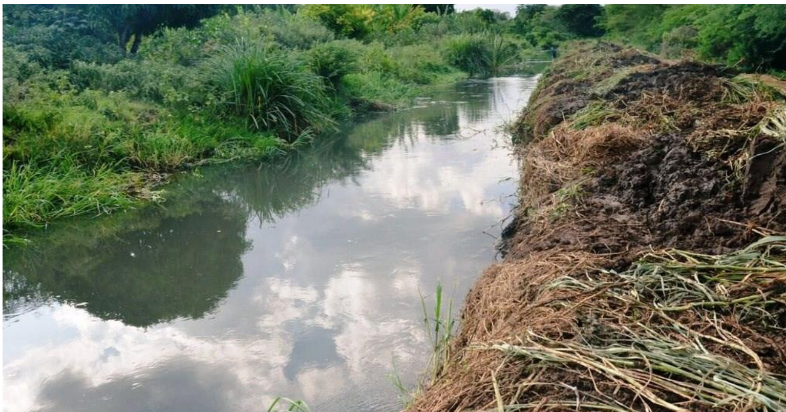
A section of the Njoro Kubwa Canal that is being desilted

M ore than 2,000 farmers in Taveta Sub County are expected to benefit from the ongoing desilting of Njoro Kubwa Canal which will increase water supply to their farms. The farmers mainly drawn from Mboghoni Ward have been complaining of inadequate water supply as they depend on the canal to irrigate their farms.