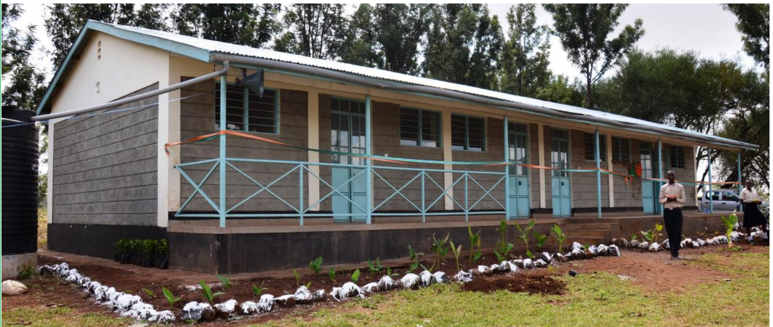
Chumvini Youth Polytechnic training workshop constructed by the County Government