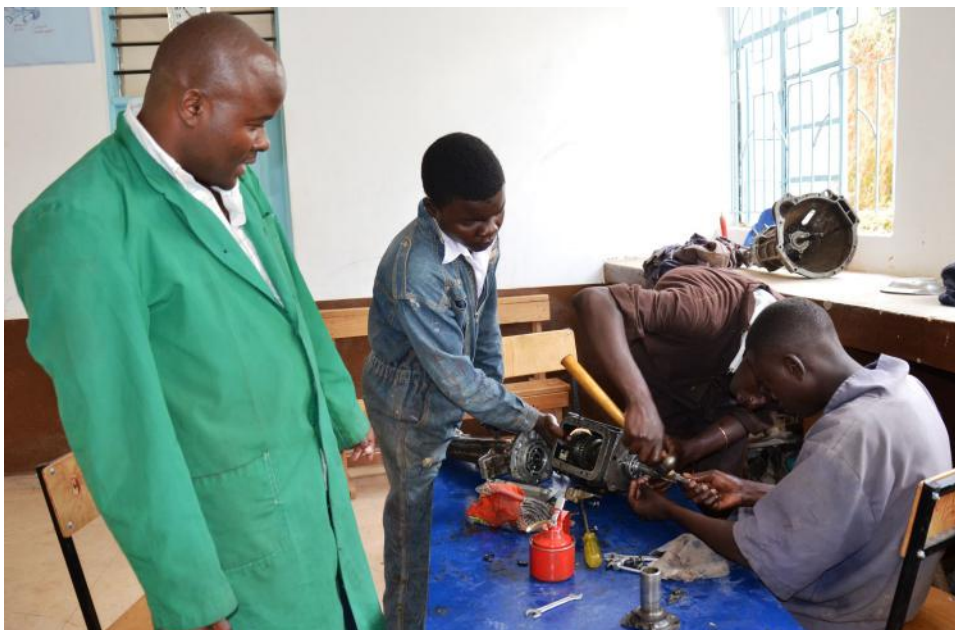
Mwagafwa Youth Polytechnic students in a practical lesson

All students in registered Vocational Training Centres in the County will receive Kshs. 10,000 per trainee per year to improve access to quality of education at the Youth Polytechnics.