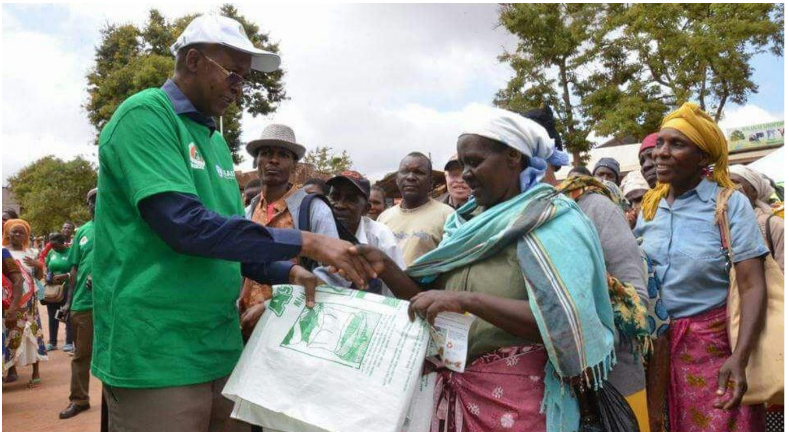
Governor John Mruttu giving farmers in Mwatate Sub County the hermetic bags for storing their farm produce

The campaign to promote the use of the bags has been dubbed “ Zuia njaa na gunia tano kwa kila jamii ” also targets other African counties in a bid to ensure the continent is food secure.