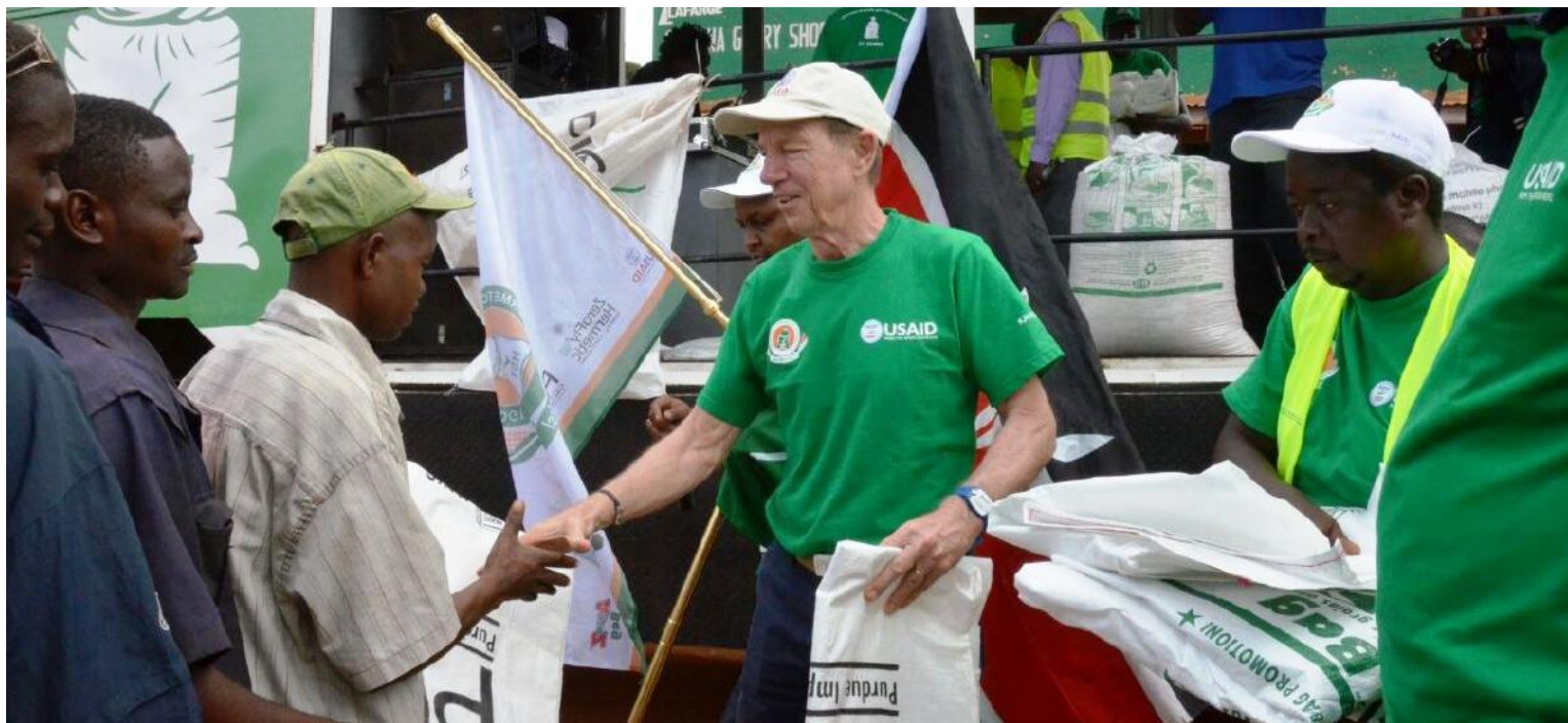
A USAID official giving Mwatate Sub County residents the hermetic bags for storing their farm produce for a long time without being infested by pests

County residents have been urged to fully embrace the newly launched hermetic grain storage bags that are affordable and efficient.