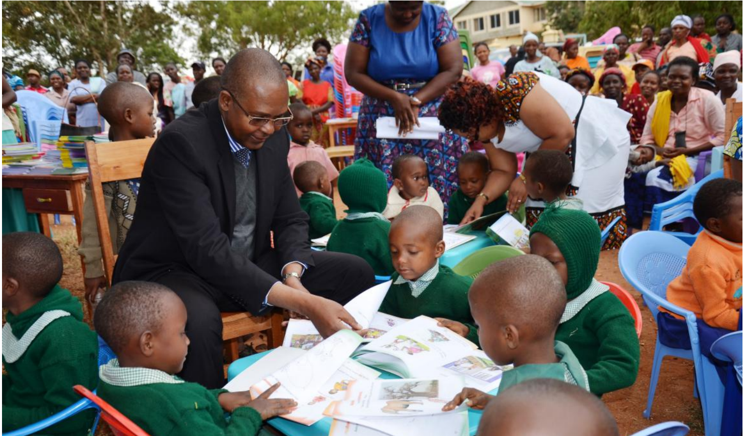
Governor John Mruttu (seated in spectacles) assisting ECDE children goes through their learning materials provided by the County Government

T he County Government through the Department of Education and Libraries has introduced capitation in all the 327 public ECDEs to supplement parents efforts to ensure children access quality early childhood education.