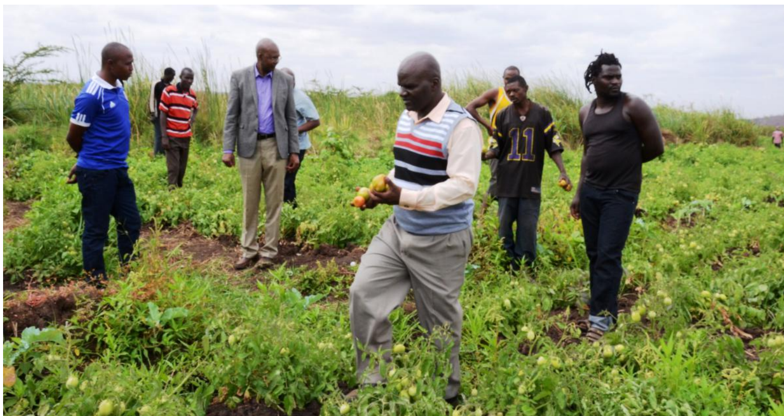
Governor John Mruttu (in a grey coat, centre) when he visited one of the farmers producing tomatoes in Taveta Sub County

More than 7 million dollars have been set aside for the implementation of the three-year project.