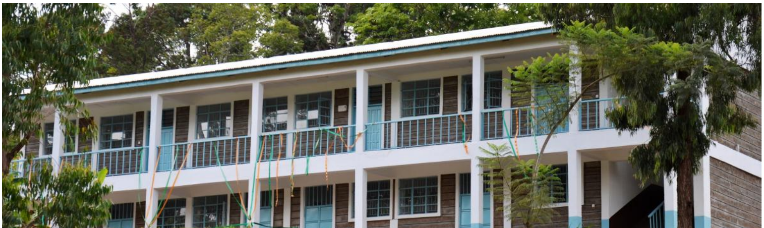
Mwagafwa Youth Polytechnic twin block complex constructed by the County Government

The County has 24 vocational training centres with an enrolment of 2,250 trainees but still they have the potential of accommodating 4,350 trainees.