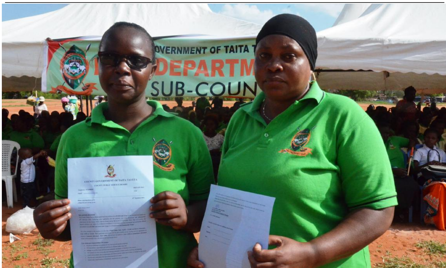
Some of the ECDE teachers display their appointment letters immediately they were issued to them in the inaugural ceremony to engage ECDE teachers on permanent and pensionable basis at Moi Stadium