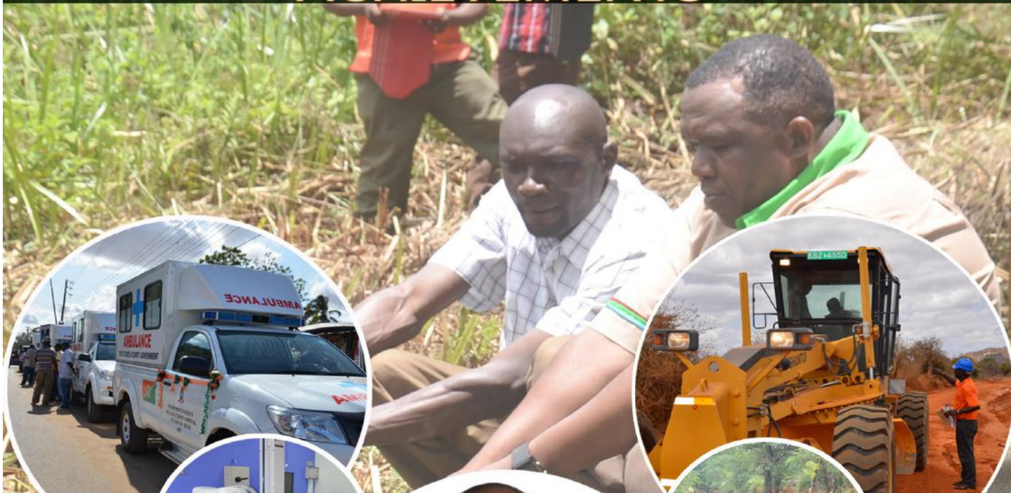
Health & Medical Services