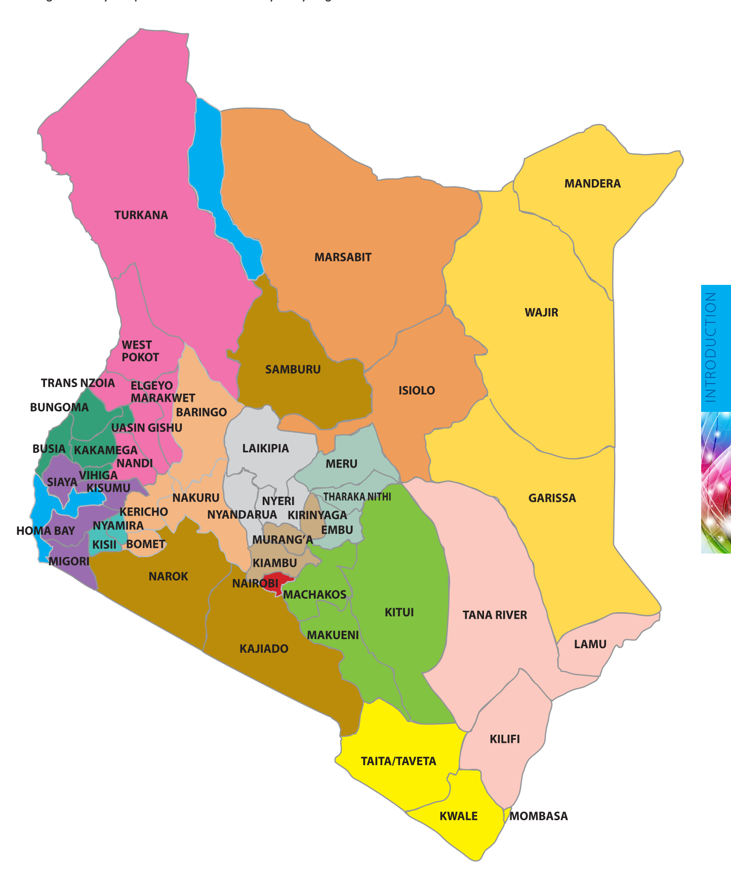
Figure 1: Kenya Map with Cluster Counties by Study Regions