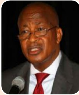
Justice Paul Kihara Kariuki Attorney General