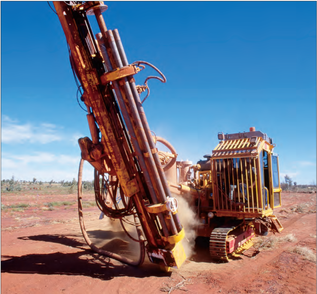
A mobile drilling rig