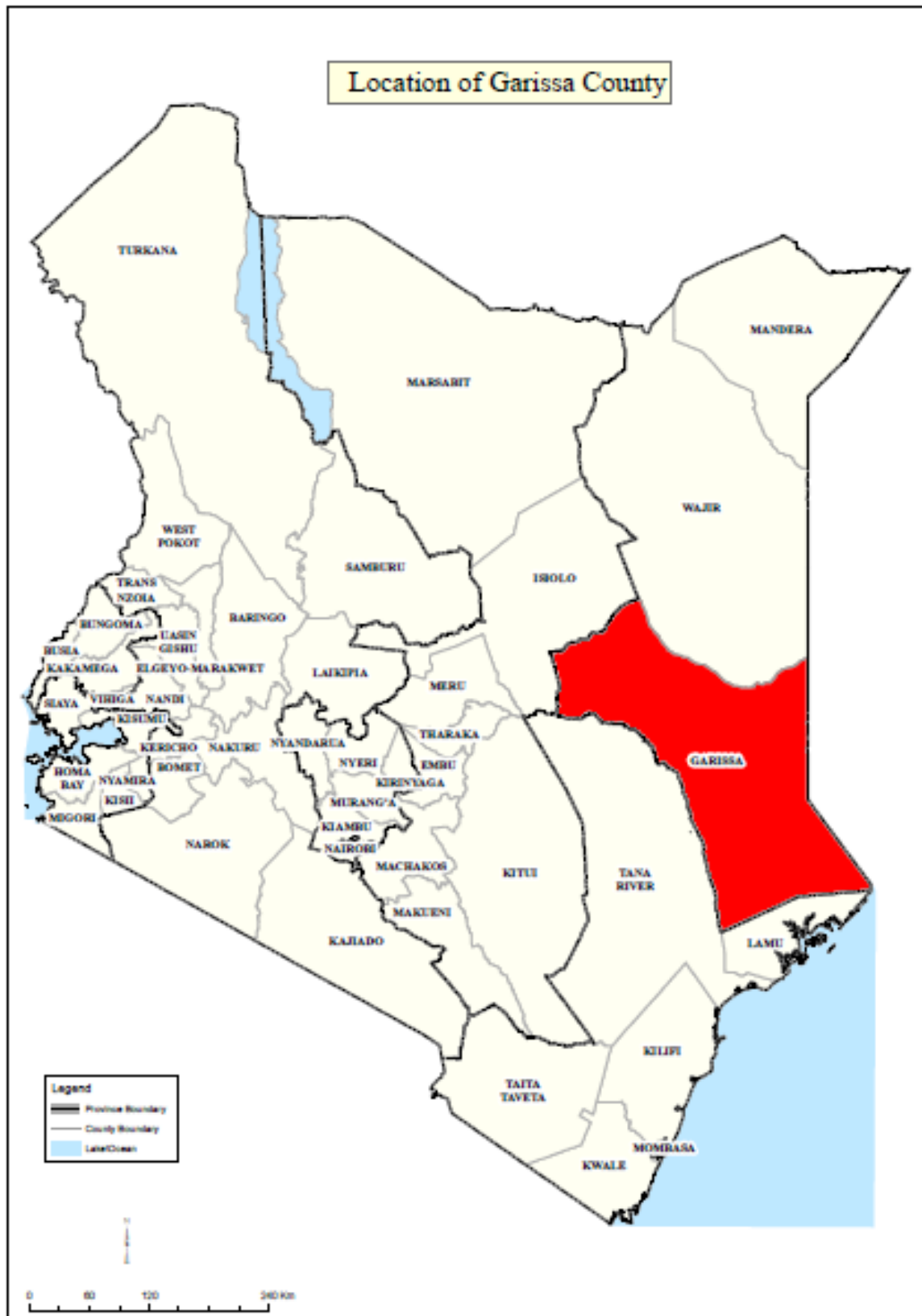
Map 1: Location of Garissa County in Kenya