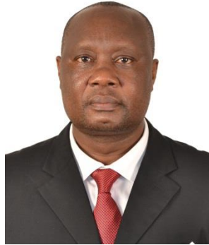
Hon. Sospeter Ojaamong, H.E, Governor – Busia County Government